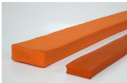
Figure 1. CS-5000 pre-exposure to water and 400% swell after 30 days exposure in freshwater.